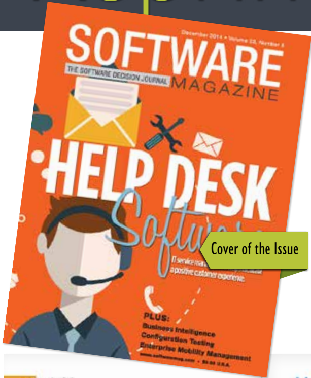
Cover of the Issue