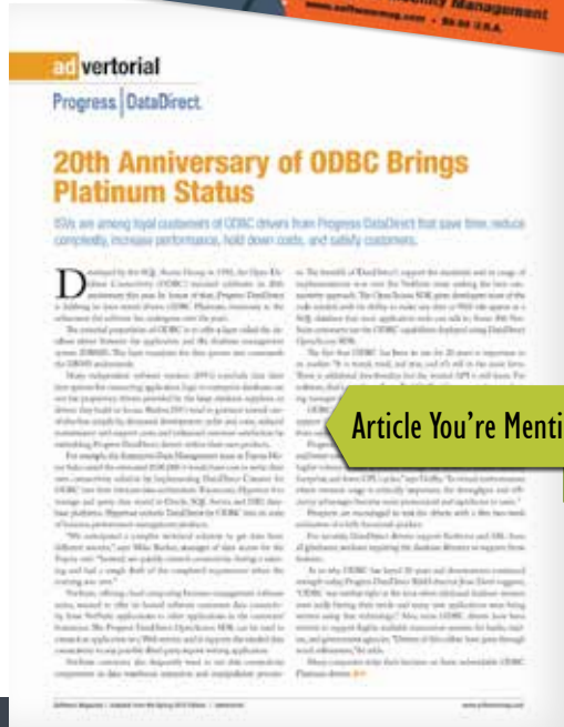
Article You're Mentioned in