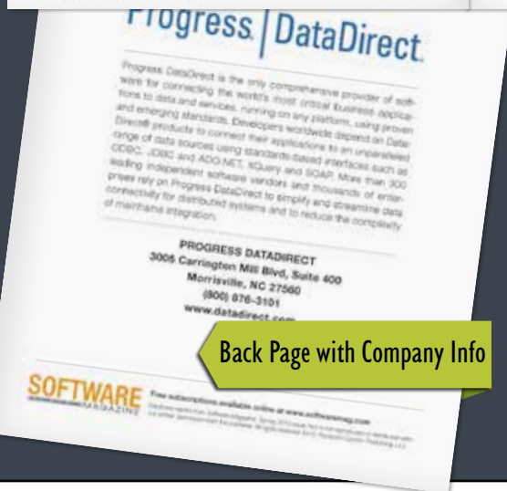
Back Page with Company Info